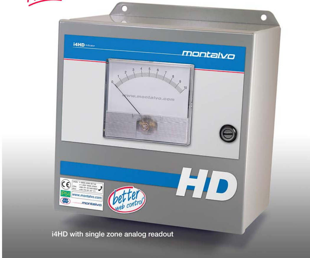
i4HD with single zone analog readout