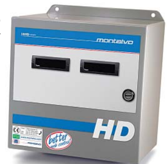
i4HD with dual zone digital readout